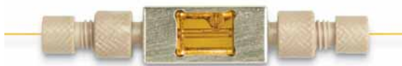
Clear Conductive Union

Make secure, perfectly-aligned, true zero-dead-volume connections with renewable PicoClear™ Unions.